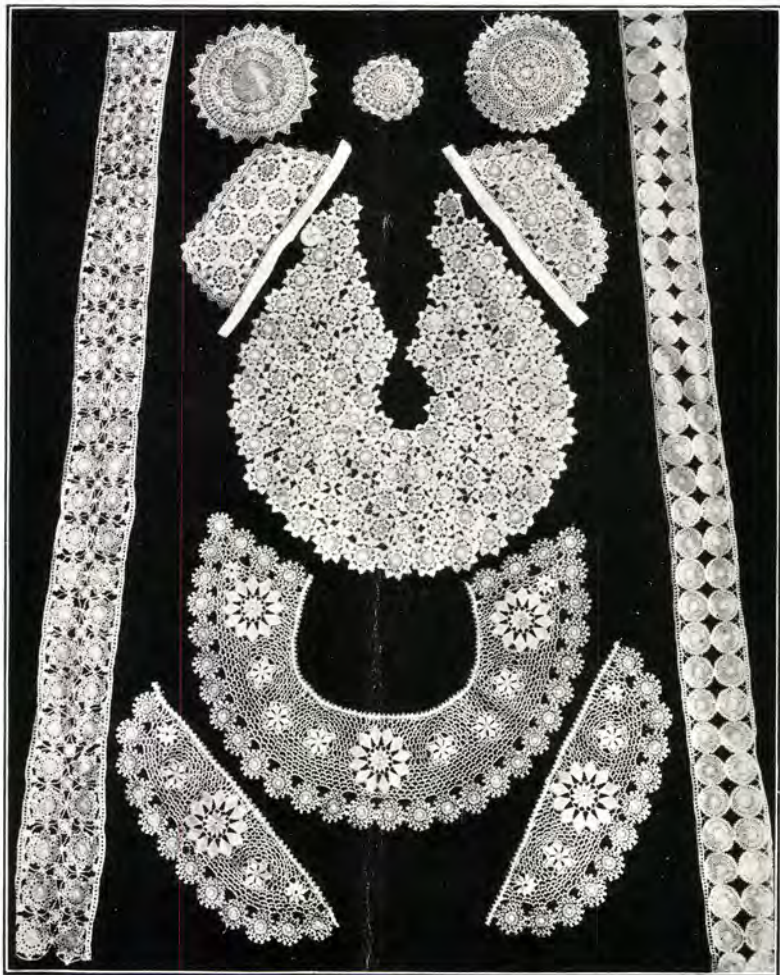
SPECIMENS OF LACE MANUFACTURED AT THE EVELINA DE ROTHSCHILD GIRLS' SCHOOL, JERUSALEM.