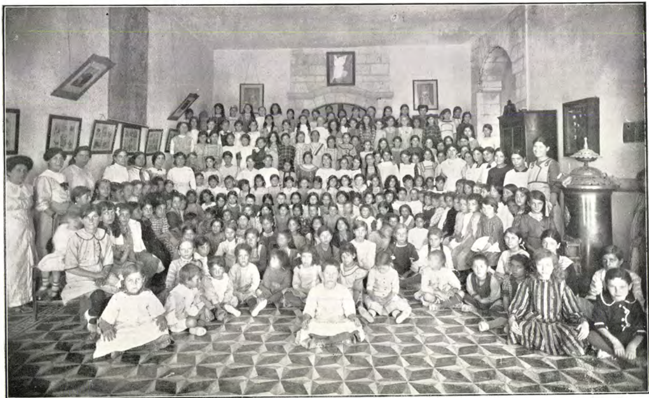
A GROUP AT THE EVELINA DE ROTHSCHILD GIRLS' SCHOOL, JERUSALEM, ASSEMBLED FOR DISMISSAL PRIOR TO THE VACATION.