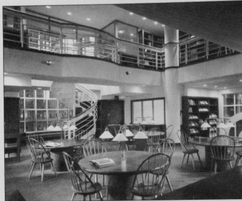
Reading Room at the University of Pennsylvania

quiet, beautiful space for intensive research. At the same time, scholars interact at weekly seminars in which they present, discuss, and debate their specific projects. The results of their research are delivered at a three-day public colloquium in the spring of each academic year.