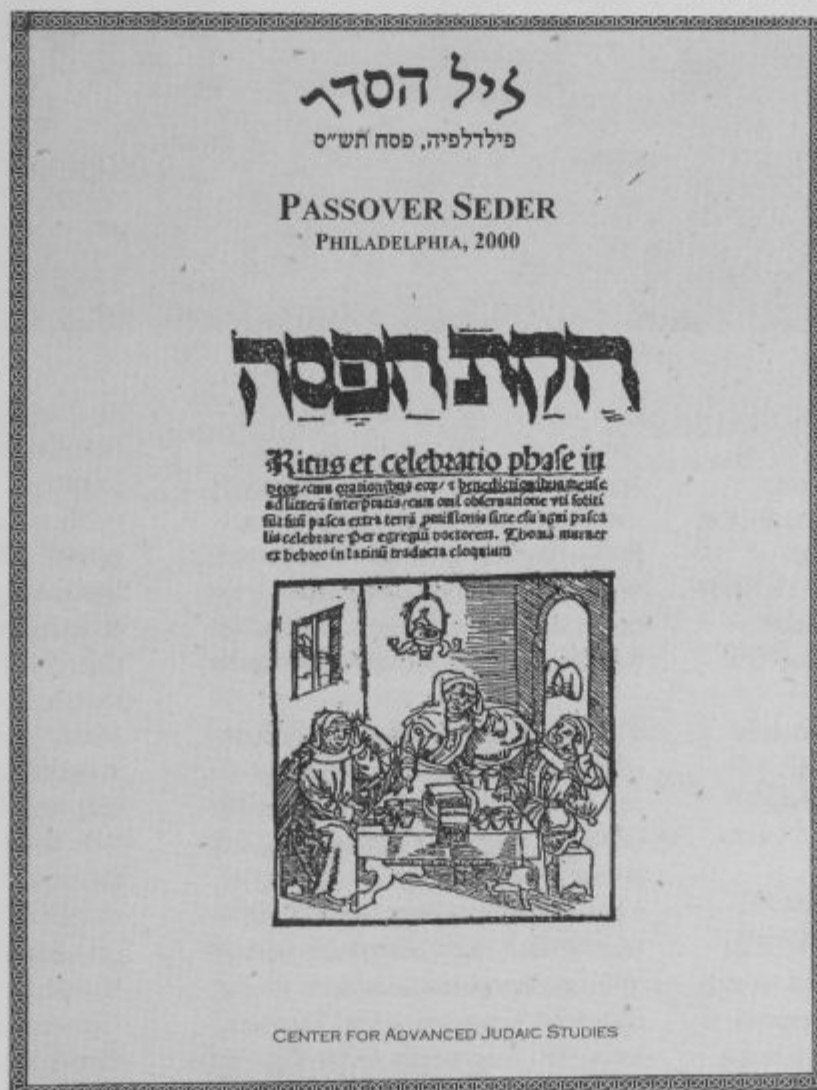
Front page of Haggadah assembled by CJS 2000 Fellows (Christian Hebraism), image from frontispiece Latin translation of Haggadah, printed in Frankfort an Oder, 1519

The creation of academic centers for Jewish studies, which are rapidly multiplying on campuses across North America and abroad, is a relatively recent phenomenon. These centers represent a departure from traditional programs of higher Jewish learning located in theological seminaries, which exist on the margins of academic programs of history and religious studies or in separate, Jewish studies programs at contemporary colleges and universities. The Center for Advanced Judaic Studies (CAJS) at the University of Pennsylvania, both in conception and in name, has forged a new model of postgraduate Jewish research, one that encompasses the text-based focus of traditional Jewish learning integrated within the framework of the humanities, and supported by a variety of innovative library resources and technologies.