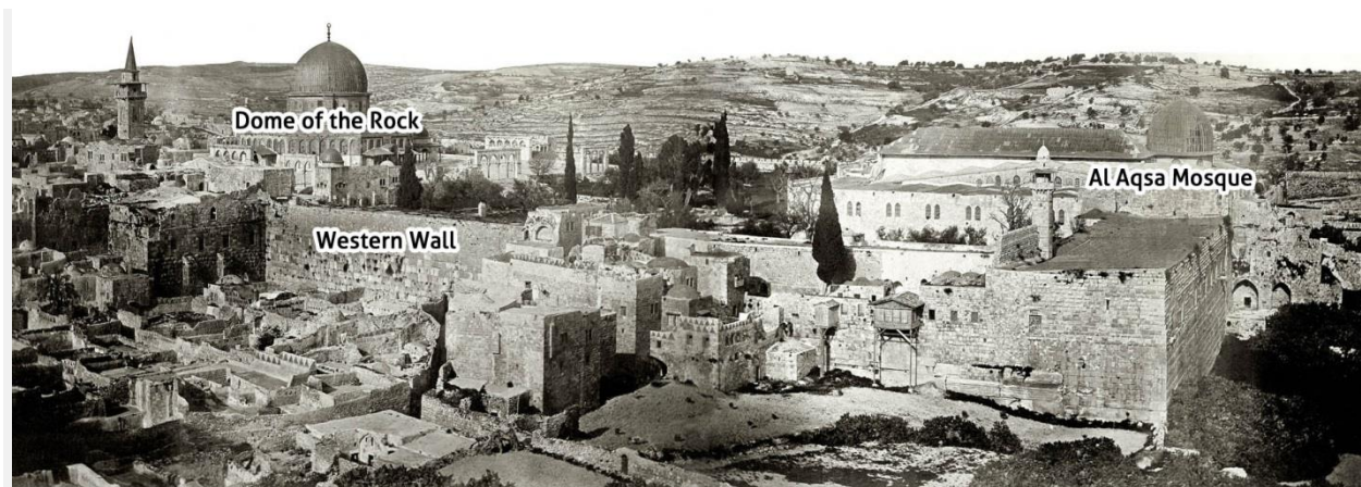
Temple Mount / Haram al Sharif panorama, 1864, (Palestine Exploration Fund) Showing the Dome of the Rock on the left, the Western Wall beneath it and the Al Aqsa Mosque on the right.

Since the days of the Grand Mufti Haj Amin al-Husseini in the first half of the twentieth century, and even more so since the Six-Day War and the unification of Jerusalem, the Mount has been more than a place of worship for Muslims. It has become a pan-Islamic religious-national symbol, and a tense place of national and religious conflict between the Jewish world and the State of Israel on one side, and the Muslim world, the Arab states, and the Palestinians on the other.